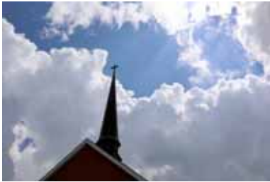
Through the sun I see the Son!